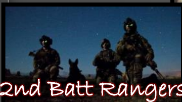
2nd Batt Rangers

Once confirmed all Delta Teams are on-board and given the approval of Delta-1, RV FOB Suse and await further tasking unless retasked by Higher HQs