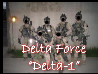
Delta Force "Delta-1"